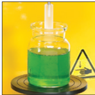
TA10 GMIA & GME probe and spec Bloom bottle

TA-DE TA-DSJ TA-FMBRA TA-JPA TA-KF TA-MP TA-PFS TA-PFS-C TA-PTF TA-SBA TA-SFF TA-TPB TA-VBJ TA-WSP and many more