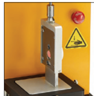
TA-BLS Bilayer Shear Test Fixture