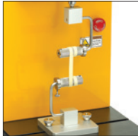
TA-NTF Noodle Tensile Fixture