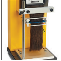
TA-HCF Hair Combability Fixture

The CT3 Texture Analyzer is used to test many different types of materials. General categories are identified and examples from each are presented.