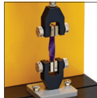
TA-DGF Dual Grip Fixture