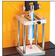
TA-TEF Tube Extrusion Fixture

TA-ATT TA-AVJ TA-BEC TA-DGA TA-FSF TA-GPJ TA-JPA TA-LTT TA-PF90 TA-PTF TA-SFJ TA-TSF